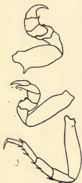
FIG. 2.— Aega ecarinata ( \times 5\frac{3}{4} ).

pair less so, and the propodus of this pair is furnished with a large cultri-form process. Five spines are present on the merus of all three pairs. Gressorial legs slender and sparsely spinulose.